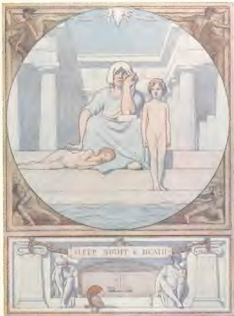
SLEEP, SORROW & DEATH.